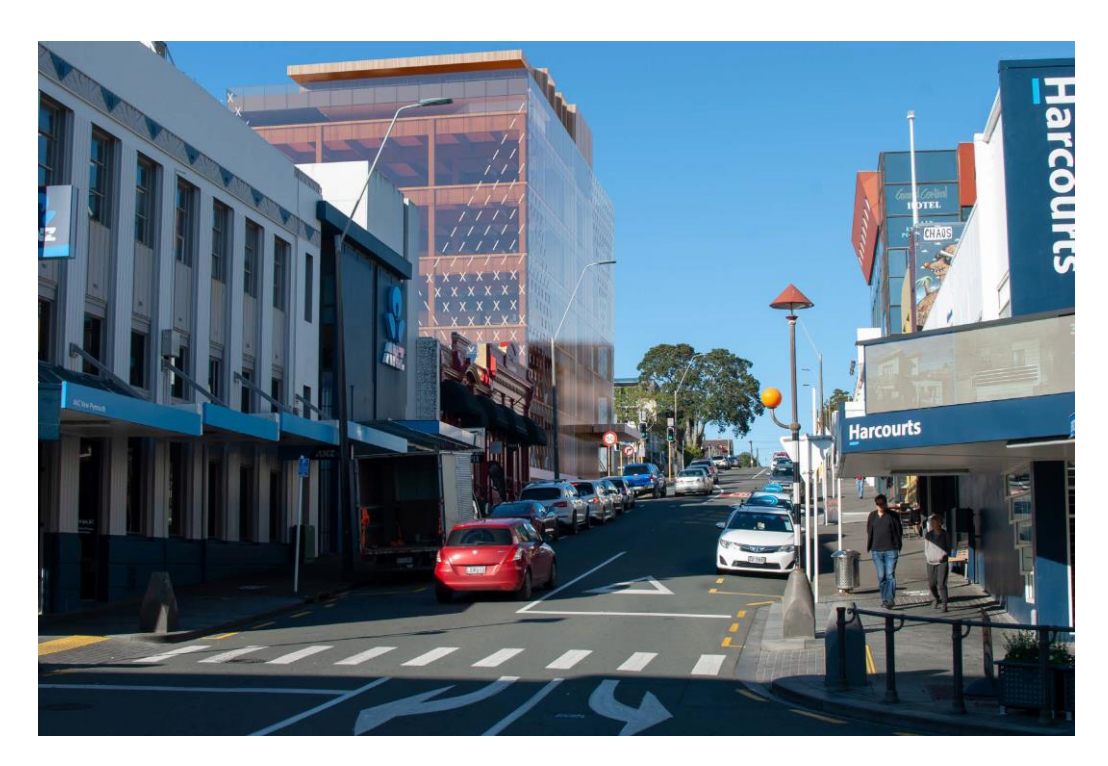
Site with proposed building