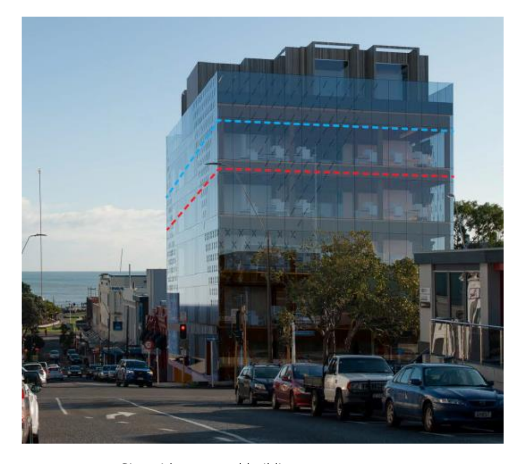
Site with proposed building