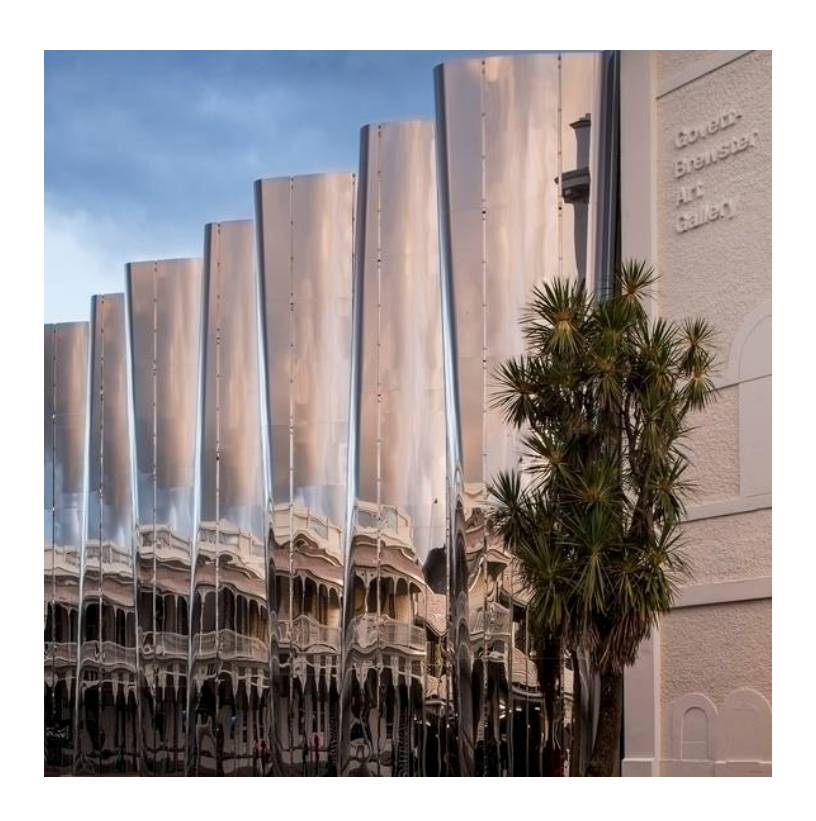
Len Lye Centre and reflected image of the White Hart Hotel