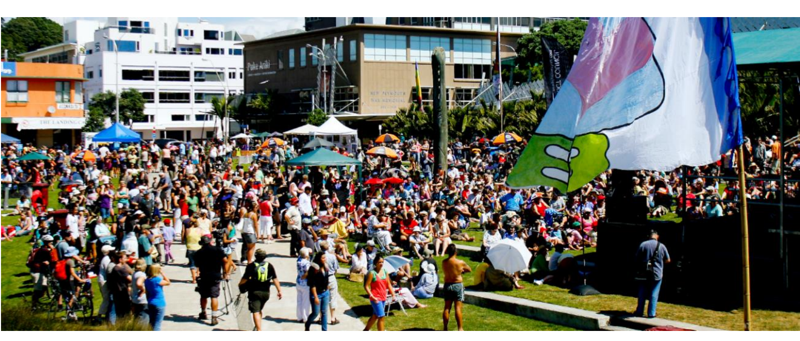
Waitangi Day Event, Puke Ariki