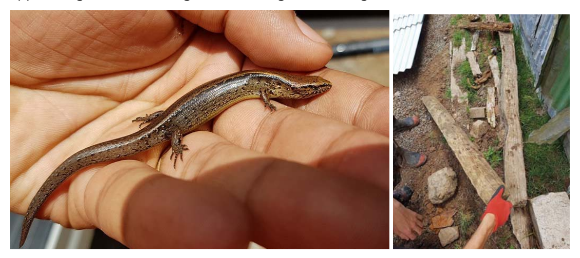
Figure 2.1 – Copper skink captured within Project area (left) and habitat it was detected in (right)

measured, photographed and released, whilst the fourth escaped. One captured individual appeared gravid, indicating that breeding is occurring at the site.