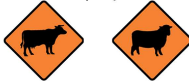
TW6 (TF1) TW6.1 (TF2)

Explanatory note: A distance in metres no less than the value of the permanent posted speed limit of the road is 100m for 100km/hour, 90m for 90km/hour etc. Similarly, 1.5 times the value of the permanent posted speed limit of the road is 150m for 100km/hour, 135m for 90km/hour etc. Similarly, 2 times the value of the permanent posted speed limit of the road is 200m for 100km/hour, 180m for 90km/hour etc. TW6 (TF1) or TW6.1 (TF2) are the following two signs.