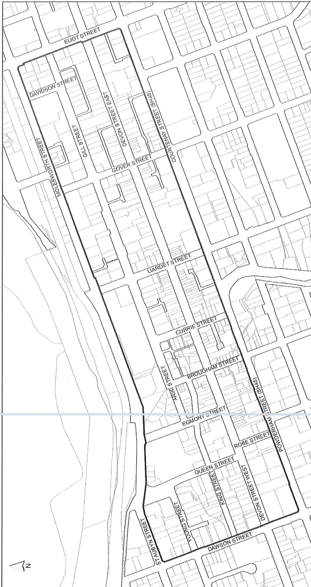
Table 23.14a Extent of the PARKING EXEMPTION AREA