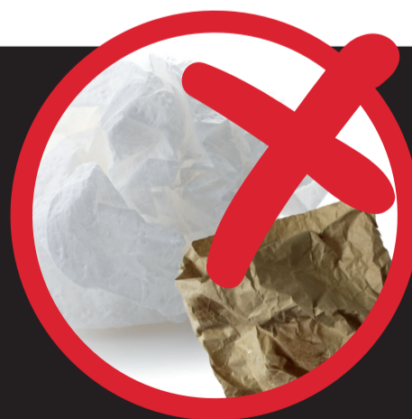
Paper towels, food stained paper