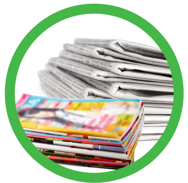
Newspapers and magazines incl. glossy