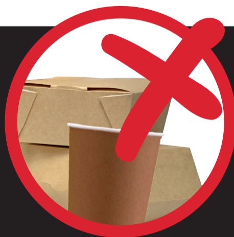
Coffee cups, compostable containers