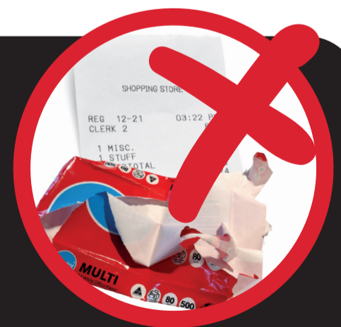
Plasticised paper, thermal receipts