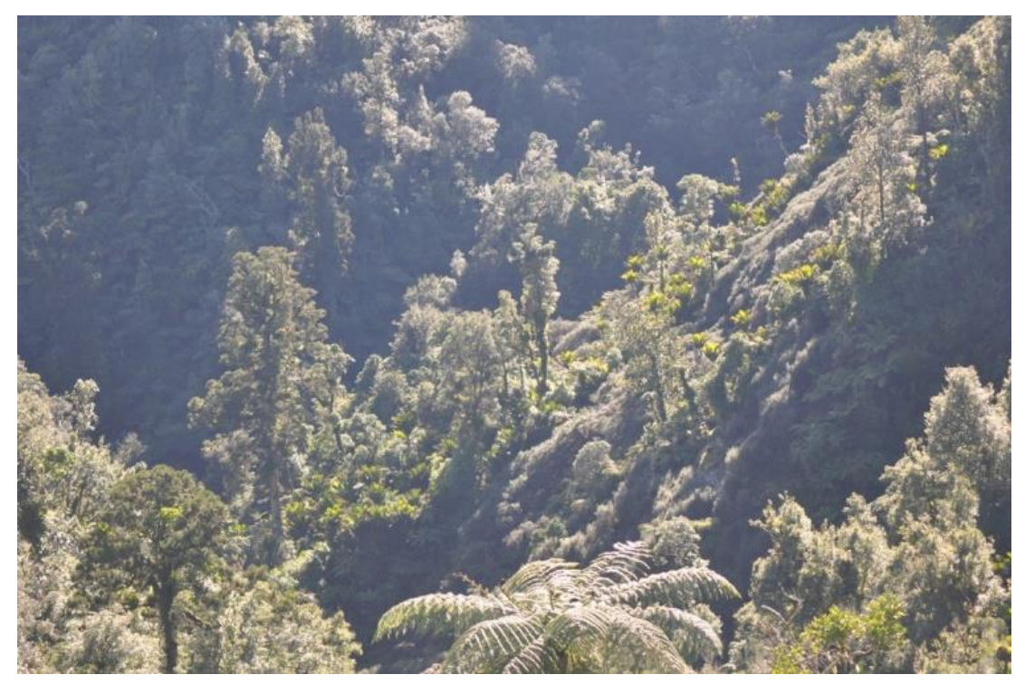
Plate 1: Tawa-kamahi forest with emergent podocarps in the upper Mangapekepeke Stream valley. The rerouting of SH3 to the north of Mount Messenger will pass along the lower slopes of this valley. 5 September 2017.