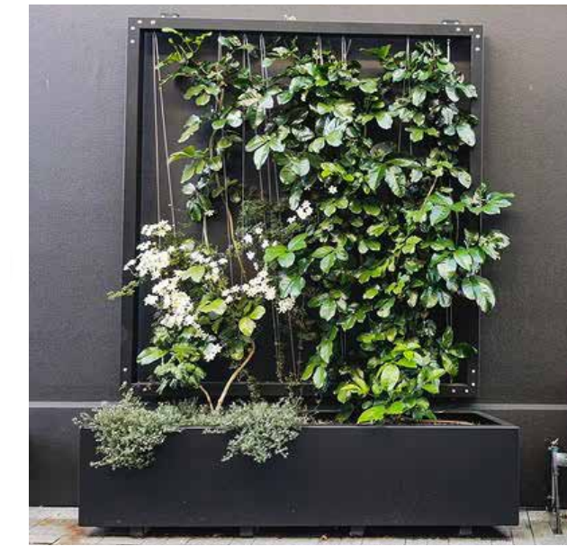
Tecomanthe speciosa native evergreen vine. Frame with stainless steel wire. Osmos s21 planter by tilleygroup.co.nz