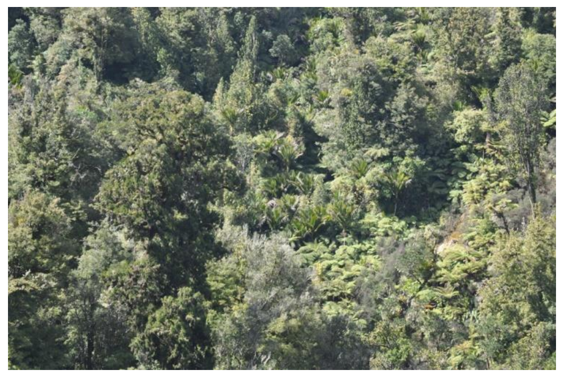
Plate 3: Southern end of proposed tunnel entrance (nīkau stand, photograph centre) for the proposed rerouting of SH3, Mount Messenger. 19 September 2017.