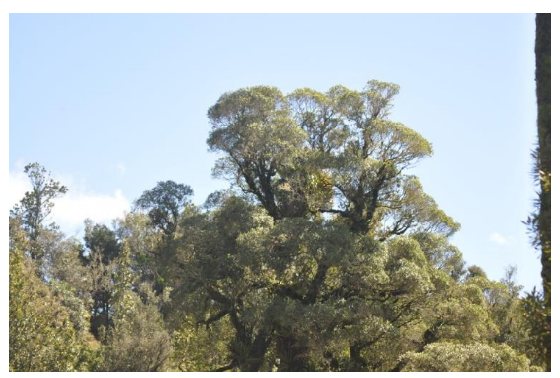
Plate 2: Northern rata with a fully-foliaged crown on an upper hillslope to the east of the existing route of SH3, Mount Messenger. 19 September 2017.