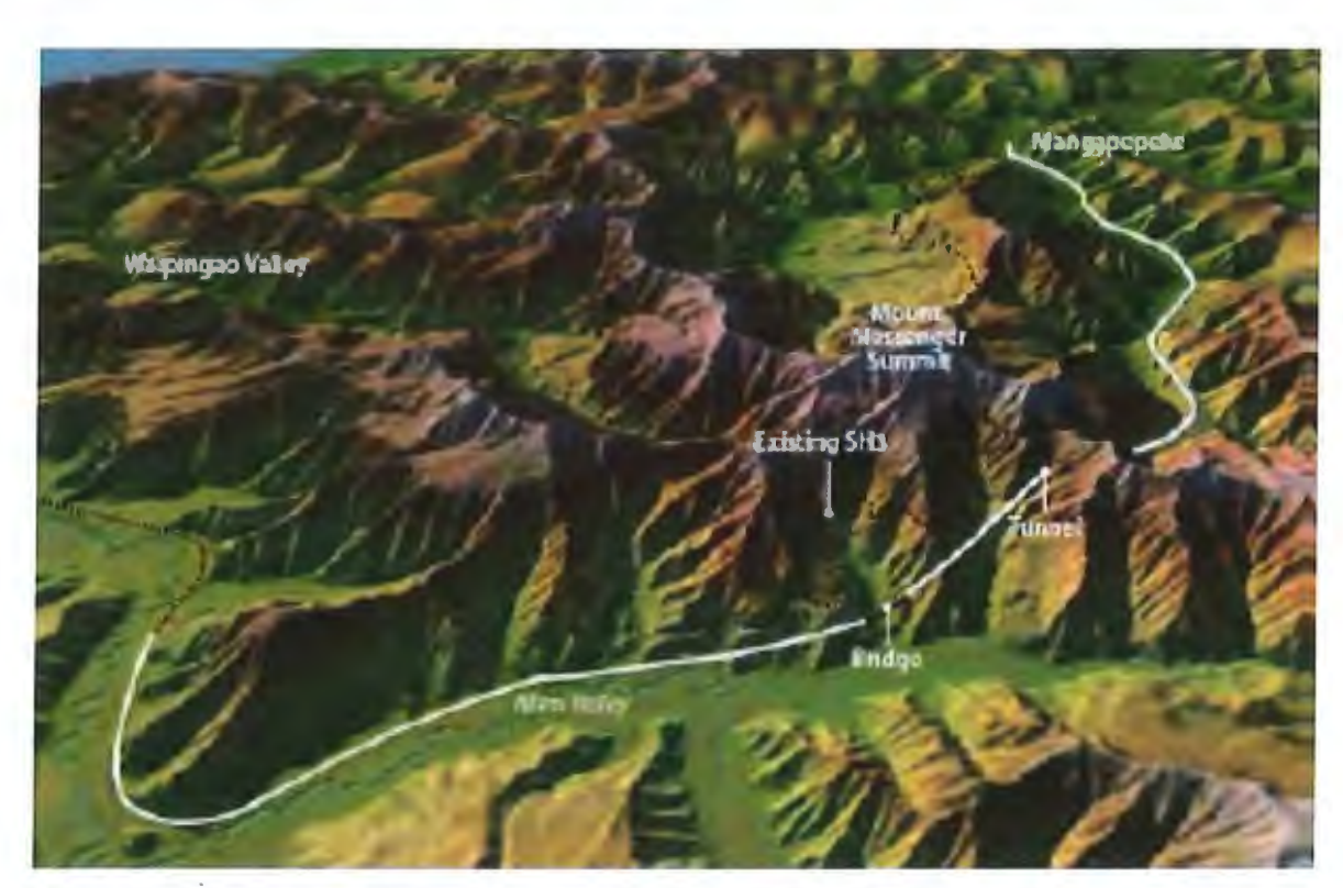
Figure 4.2 - Elevation model looking from the south to the north along the alignment