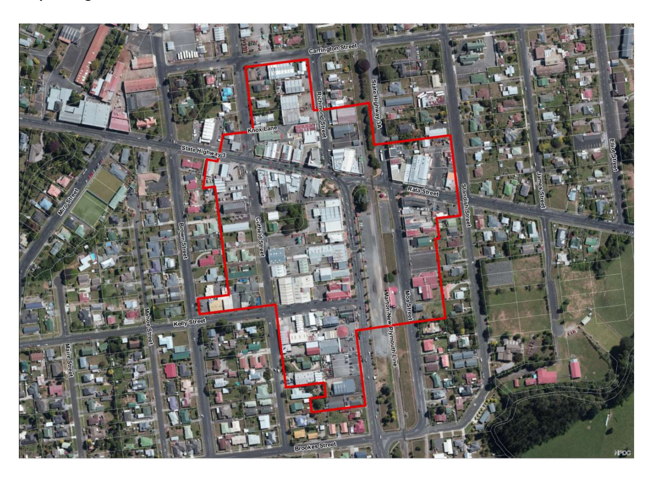
Map 1 – Inglewood Town Centre Area

Red line outlines Inglewood Town Centre Area and Business Environment Area A, B, C or D - where new TAB venues may be established