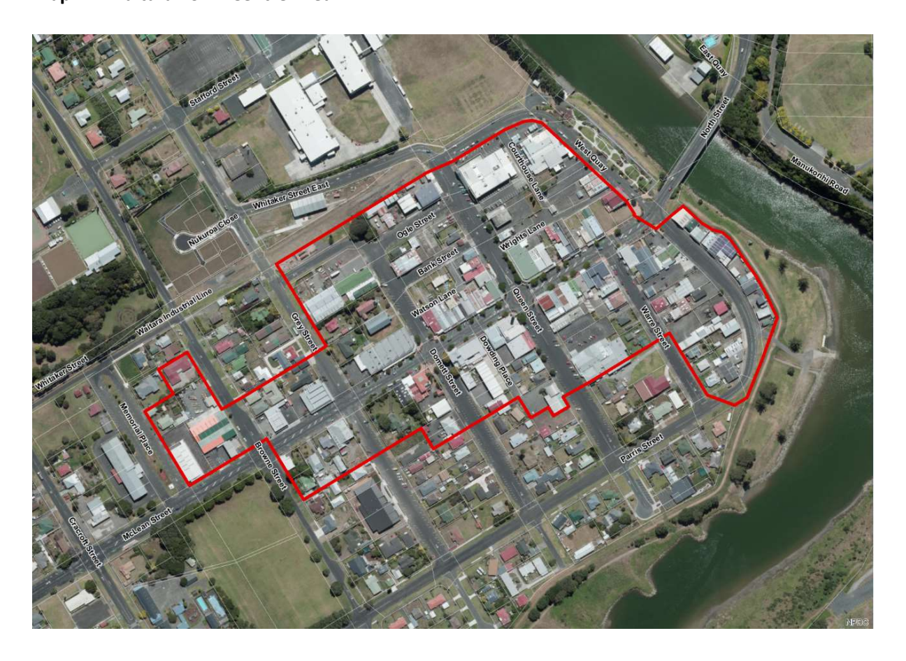
Map 2 – Waitara Town Centre Area

Red line outlines Waitara Town Centre Area and Business Environment Area A, B, C or D where new TAB venues may be established