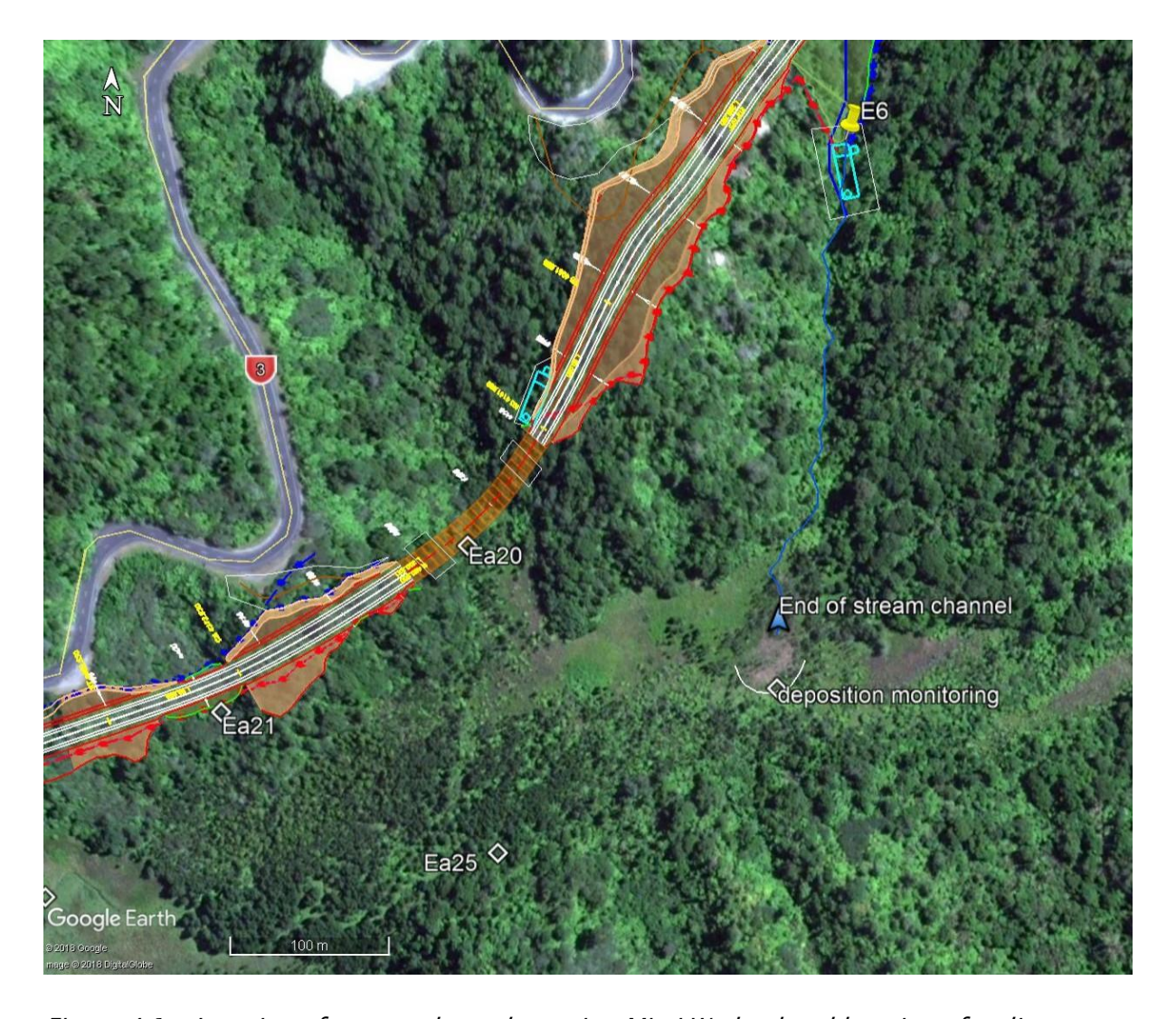
Figure 4.1 – Location of stream channel entering Mimi Wetland and location of sediment deposition monitoring in the event of SRP Management Threshold exceedance