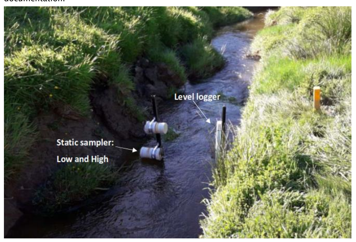
Figure 4.1 - Static sampler and level logger configuration at WQ4

Static samplers shall be emptied as soon as practical following a Trigger Event. The samples collected shall be emptied into a clean container for testing of field parameters or into laboratory supplied containers and shipped to a laboratory under chain of custody documentation.