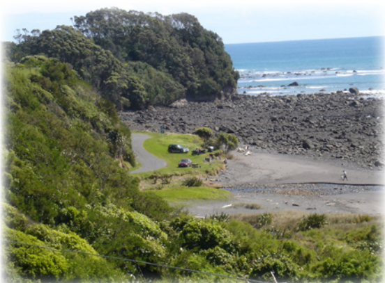
Lower Greenwood Rd