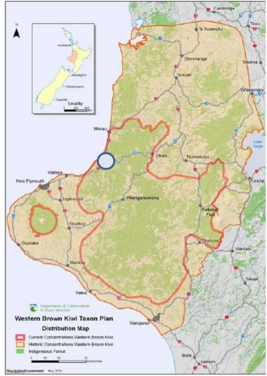
Figure 2. Current and historic Western kiwi distribution (from Scrimgeour & Pickett 2011). The location of the Project Area is shown with a blue circle.

6.10 The Western kiwi population has substantially contracted since the 1980's, most likely due to the combined effects of habitat loss and fragmentation, and predation by stoats, ferrets, dogs and feral cats (Scrimgeour & Pickett 2011). These agents of decline continue to operate on all Western kiwi populations, including those at Mt Messenger. The kiwi population at Mt Messenger is located towards the periphery of the contracted Western kiwi taxon distribution (Figure 2).