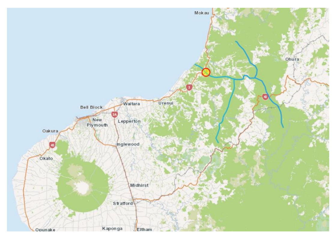
Figure 1. Native forest (green) of northern and central Taranaki, indicating some pathways of essentially contiguous native forest from the sea to inland forests (blue lines), and the crucial corridor of the Project Area (red and yellow circle) that maintains this continuity.

effect on less mobile species found at that site (Tewksbury et al. 2002, Keller & Largiadèr 2003).