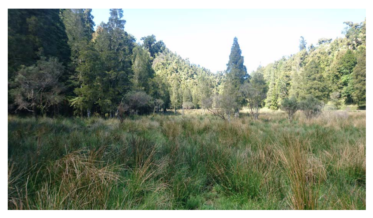
Figure 2.2 – Kahikatea treeland in the Mangapepeke Valley consists of kahikatea (erect conifer shaped trees) and scattered manuka (rounded shrubs) and exotic rushland (foreground), taken on the property margin of Ngāti Tama and private land (approximately NZTM 1739219; 5615107).