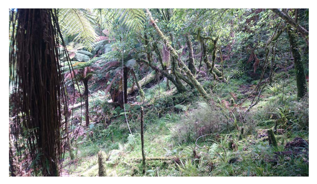
Figure 2.4 – Canopy gap in manuka, treefern, rewarewa forest showing the sparse understorey and regeneration failure of shrubs and trees. (Approximately NZTM 1739068; 5695376).