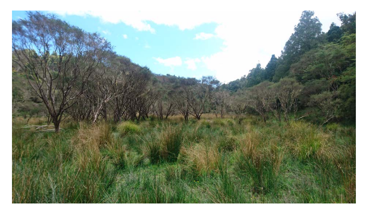
Figure 2.3 – Scattered manuka scrub (rounded shrubs) amongst dominantly exotic rushland (foreground), with a fringe of kahikatea treeland on hillslope margin in the Mangapepeke Valley (approximately NZTM 1739100; 5695277). The lime green tussocks are the native Carex virgata.