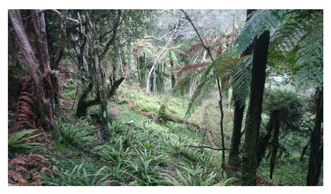
Figure 2.5 – Canopy gap in manuka, treefern scrub showing the sparse understorey and regeneration failure of shrubs and trees. (Approximately NZTM 1739058; 5695405).

Possum sign and browse on palatable trees appeared to be less common and severe in the lower part of the valley, and while not common, trees including mahoe and kamahi had dense canopies and were flowering heavily — signs of a low(er) possum population.