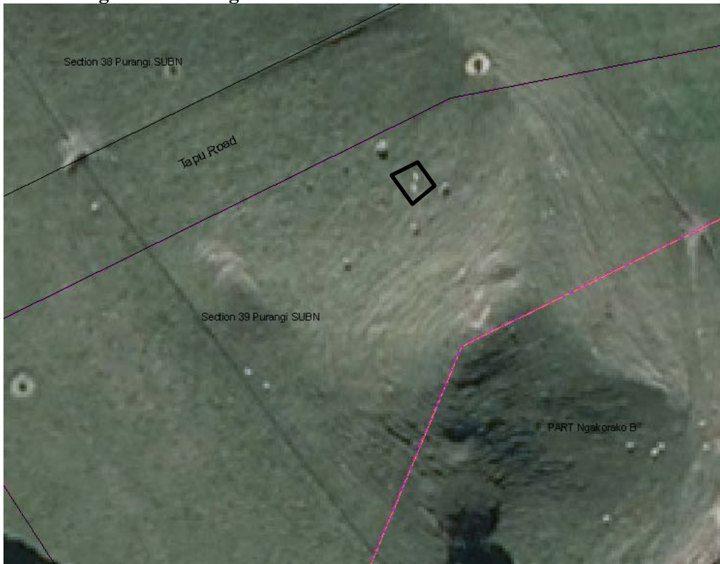
The three identifiable grave sites at Purangi

Outlined area indicates the area of pre 1900 development at the cemetery, constituting an archaeological area under the Historic Places Act 1993.